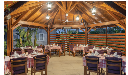
Mexican Restaurant À La Carte