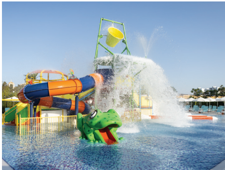
Beach Kids Aquapark