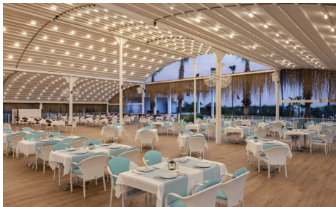
Fish Inn Restaurant À La Carte