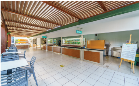
Snack Restaurant & Bar