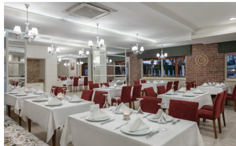
Verona Ristorante À La Carte