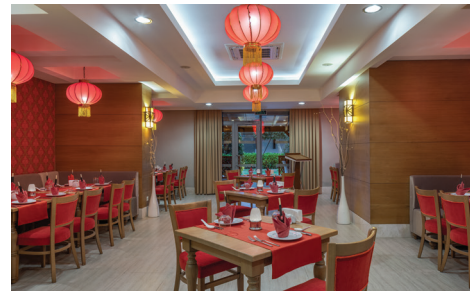
Asia Restaurant À La Carte