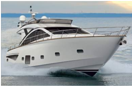
M66 – Luxury 66ft yacht