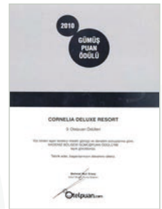
OTEL PUAN – SILVER AWARD