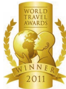
WTA – Turkey's Leading Golf Resort