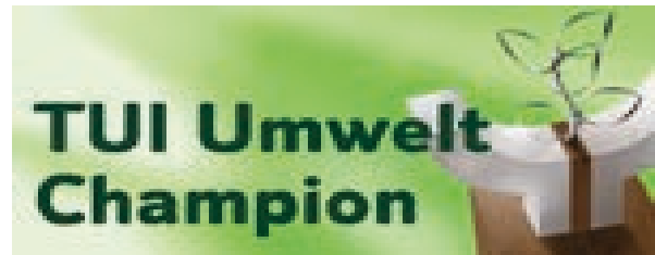
TUI – Environmentally Friendly TOP 100 Hotels Worldwide