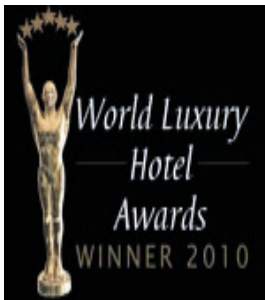
BEST LUXURY COASTAL HOTEL