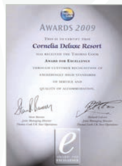
THOMAS COOK - AWARDS for EXCELLENCE