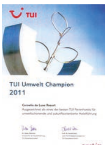
TUI – UMWELT CHAMPION