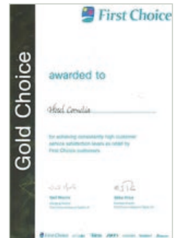
FIRST CHOICE – GOLD CHOICE