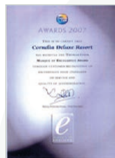
THOMAS COOK - MARQUE of EXCELLENCE