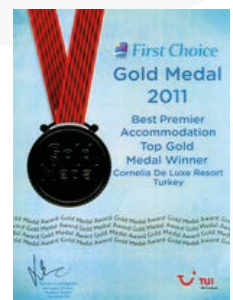
FIRST CHOICE – TOP GOLD MEDAL