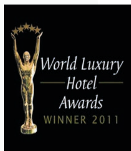
BEST LUXURY COASTAL RESORT