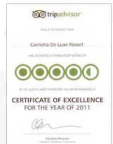
TRIPADVISOR – CERTIFICATE of EXCELLENCE