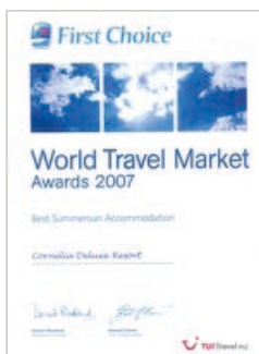
FIRST CHOICE – WORLD TRAVEL MARKET AWARDS