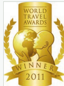
WTA – Europe's Leading Golf Resort