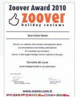
ZOOVER – BEST HOTEL BELEK