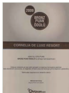
OTEL PUAN – BRONZE AWARD