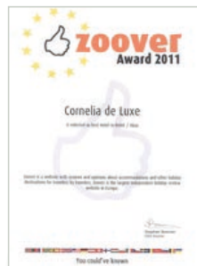
ZOOVER – BEST HOTEL BELEK