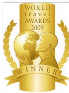
WTA – Turkey's Leading Golf Resort