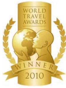
WTA – Europe's Leading Golf Resort